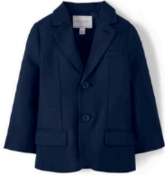
Navy blue blazer