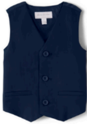
Navy blue vest