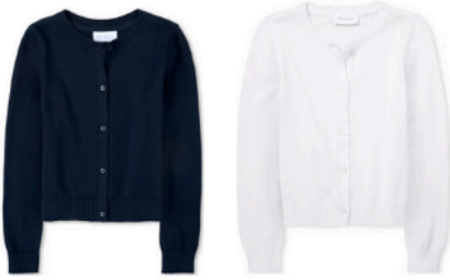
White, light blue or navy blue cardigan