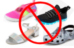
Heels over 1/2" or sandals