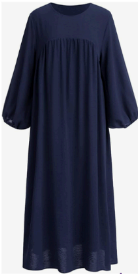
Navy blue, white or black abaya (Fridays only)