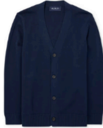
Navy blue cardigan