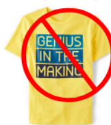
Shirts with writing or logos